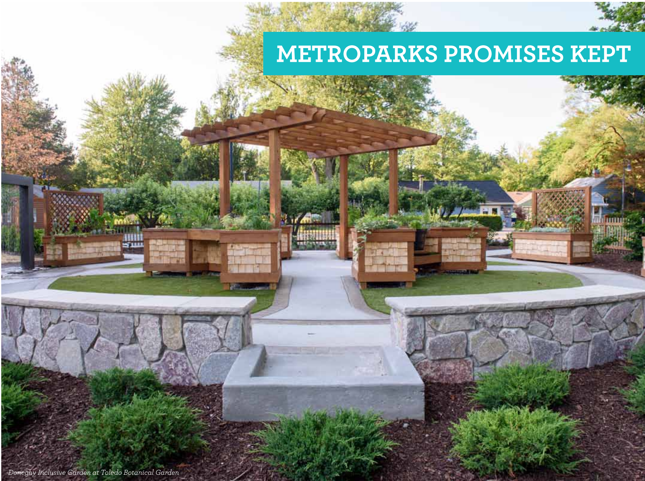
Doneghy Inclusive Garden at Toledo Botanical Garden