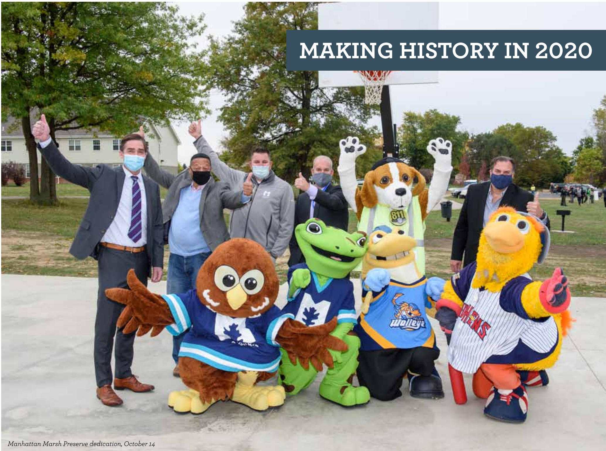
Manhattan Marsh Preserve dedication, October 14