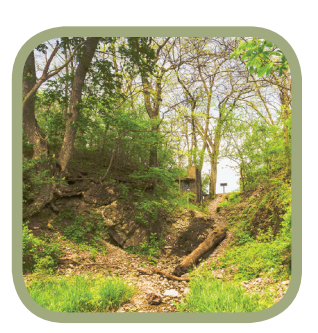
Bowling Green fault