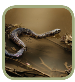
Common water snake