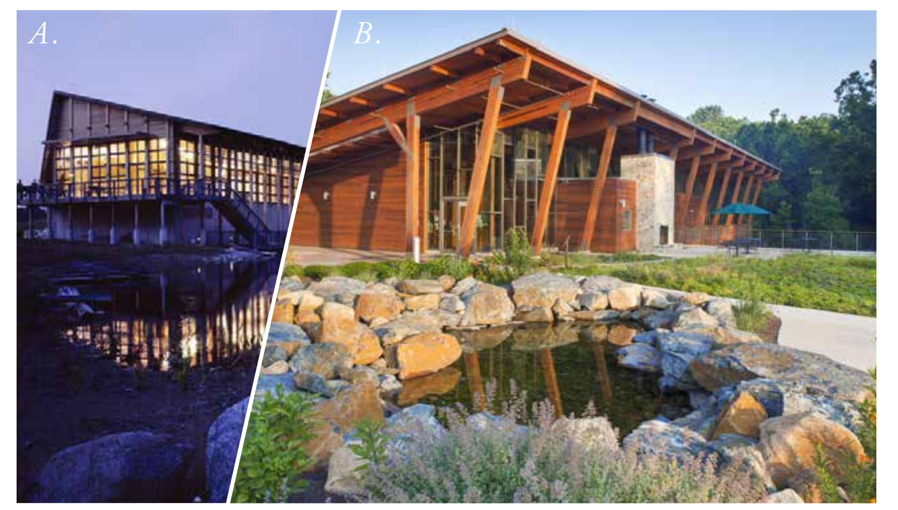
A. Indian Springs Metropark - White Lake, MI B. Robinson Nature Center - Columbia, MD