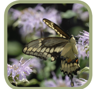
Giant swallowtail butterfly