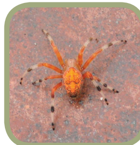
Marbled orb weaver