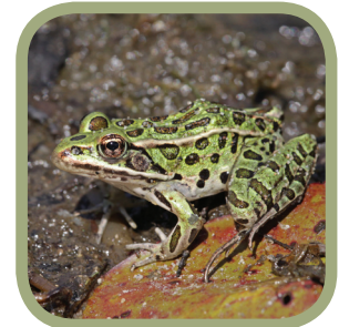
Northern leopard frog