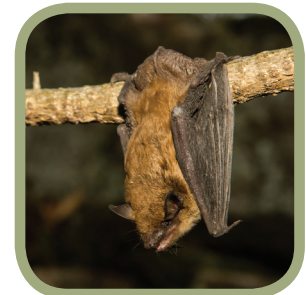
Big brown bat