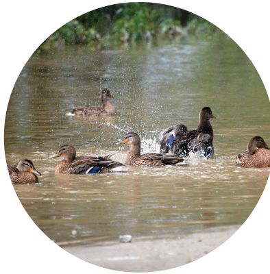
Bathing in Water or Dust