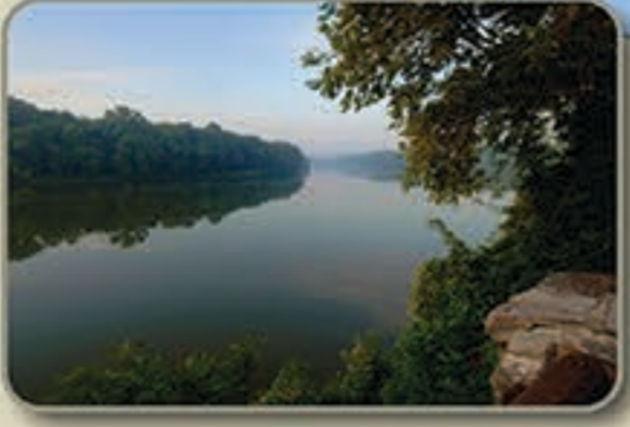
Bend View Shelter: Bend View is a scenic vantage point to enjoy a dramatic 90-degree bend in the Maumee. A WPA shelter there is available for rent.