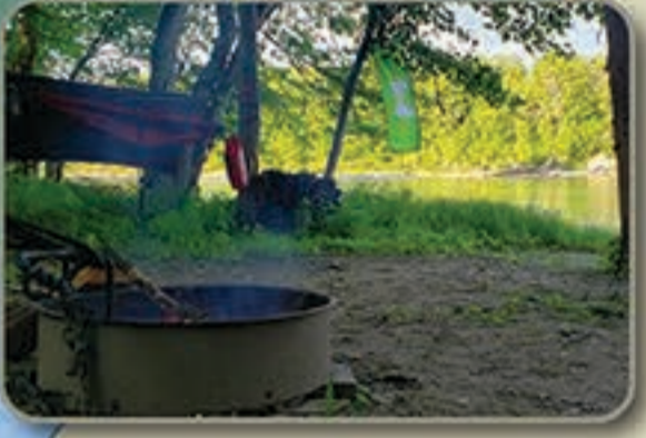
Camp at Farnsworth: Group and individual tent sites are available for a riverside camping experience.