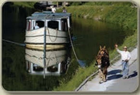
The "Volunteer" Canal Boat: The 60-passenger "Volunteer" operates on a restored section of the Miami & Erie Canal. The boat, which is towed by mules, is a replica of the vessels that carried people and supplies on the canal system.

Historic Area The Canal Experience Information Ticket Booth "Volunteer" Dock Kimble's Landing Mill Parking