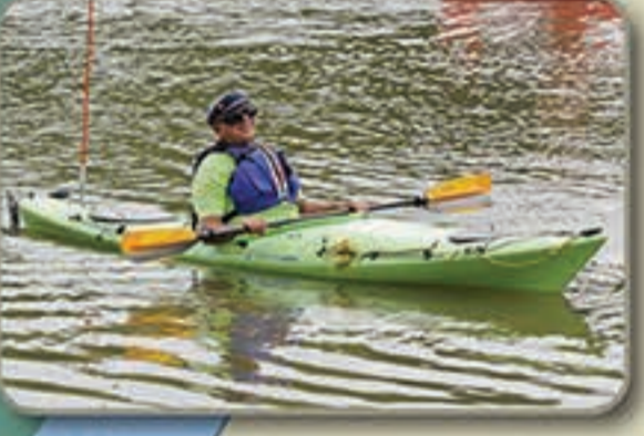
Boat & Fishing: The Boat Launch Area at Farnsworth has a seasonal kayak concession, a ramp for small boats and floating fishing platforms.