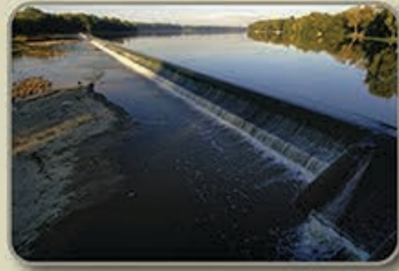
Providence Dam: A roller dam across the Maumee River is a scenic spot to fish or just relax. The dam was built to divert water into the canal.

Providence Dam Area Providence Dam Shelter (reservable) Rangers & Maintenance Overlook