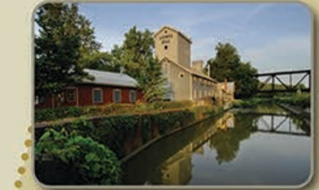
The Isaac Ludwig Mill: A working, water-powered saw and grist mill.

The Plaza Area The Isaac Ludwig Mill Lock No. 44 Heritage Center