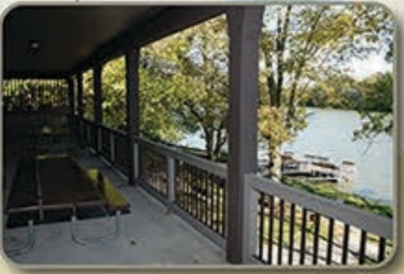
Farnsworth Shelters: The Roche de Bout and Indianola shelters at Farnsworth are available for rent. Both offer scenic locations for reunions, parties and meetings.

Historic Area The Canal Experience Information Ticket Booth "Volunteer" Dock Kimble's Landing Mill Parking